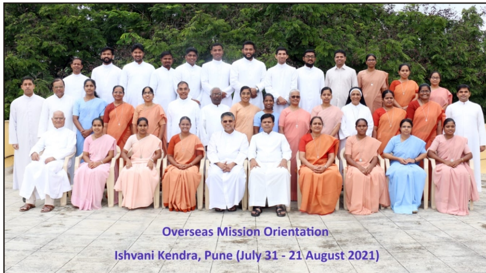
Overseas Mission Orientation Ishvani Kendra, Pune (July 31 - 21 August 2021)

The Overseas Mission Orientation course was conducted by Ishvani Kendra, Pune, from 31st July to 21st August 2021. A Religious with missionary zeal and enthusiasm, trusting completely in the saving power of God is ready to reach out to the people in need, in different parts of the world. This course is a very helpful tool, as I have been appointed to venture into the